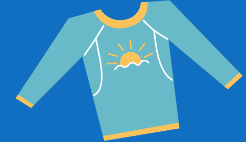
Sun Safe Clothing